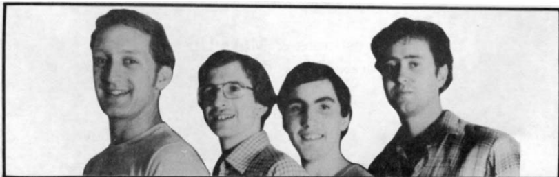
Gentlemen of the Chorus