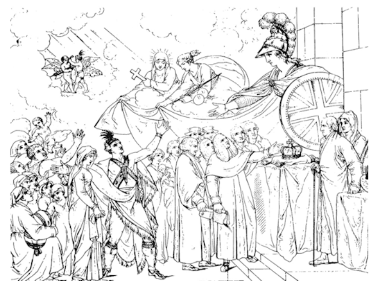
American loyalists received by Britannia