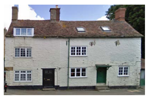
Cottage in Milborne Port