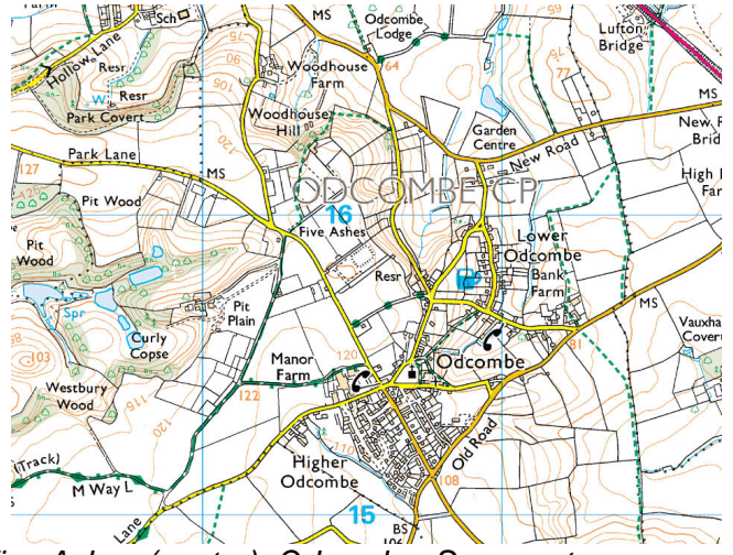
Five Ashes (centre), Odcombe, Somerset (Ordnance Survey)

I shall now give some account <sup>31</sup> of the place of my father's sepulchres. The spot where the dust of my ancestors for more than one generation is deposited is called Five Ashes. It is thus called because there is a clump of trees in the public road near the gate that leads up to this spot. This clump of trees are all ash trees, and formerly were five in number, though now, strictly, there are but four.