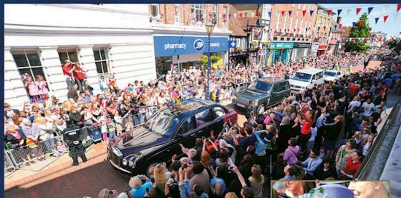
The Queen's Diamond Jubilee visit Thursday June 14th 2012