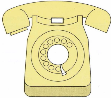
Dial and press-button tablephone