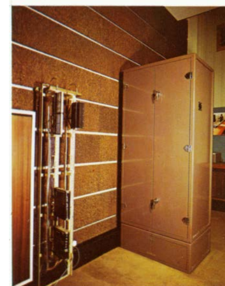
Distribution frame and cabinet for a 4+15 PABX 1 installation.

An amplifier can also be rented, to allow up to seven extensions and an exchange line to have a conference.