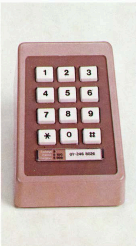
Separate Key Unit