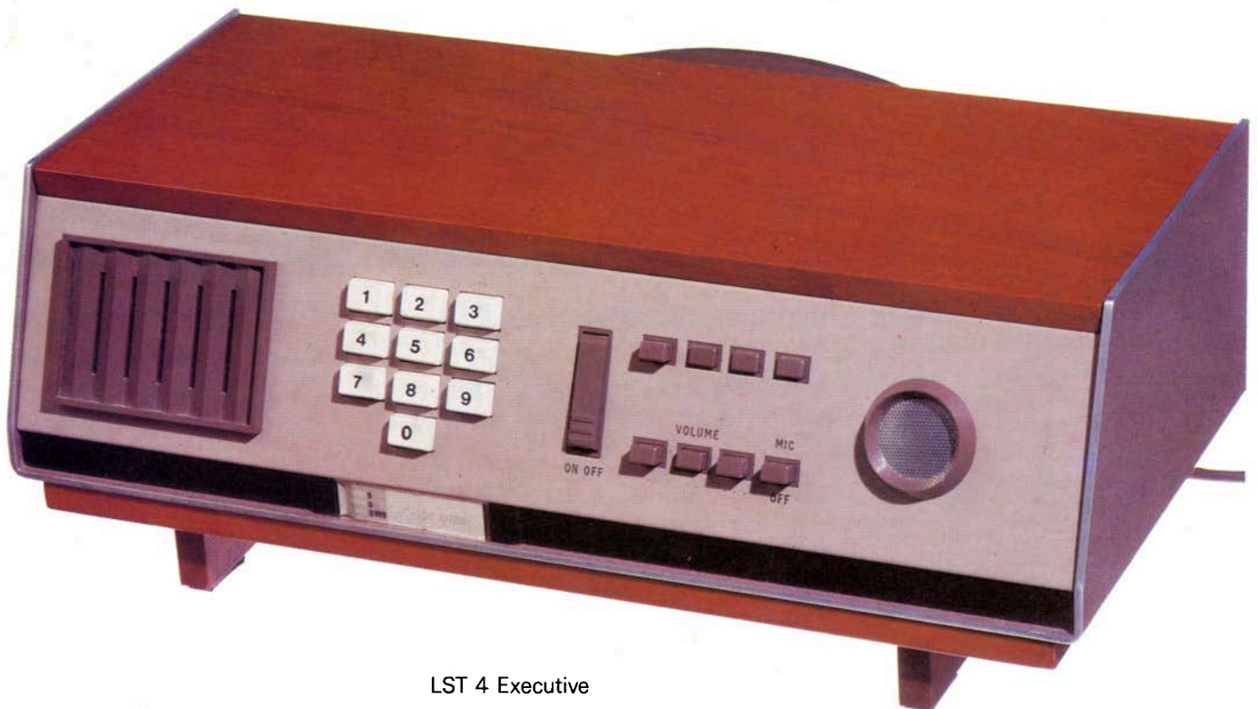
LST 4 Executive

Advice on suitable accommodation and siting should be obtained from your local Telephone Sales Office.