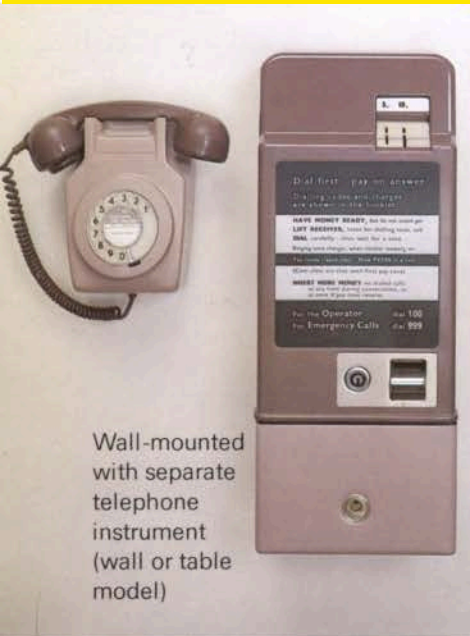
Wall-mounted with separate telephone instrument (wall or table model)

Wall-mounted and portable types are available and they can be provided on exclusive exchange lines.