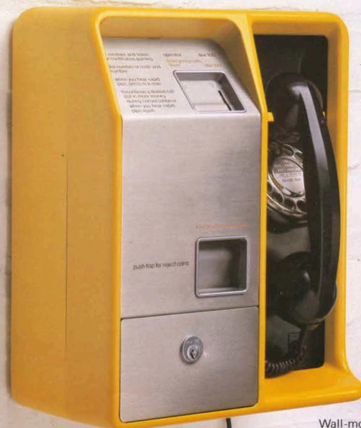
Wall-mounted with integral telephone handset.