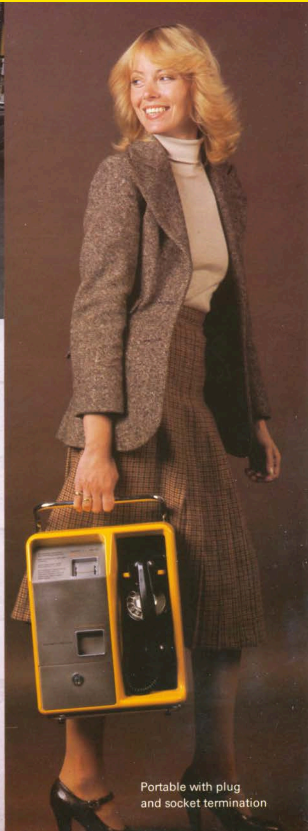
Portable with plug and socket termination