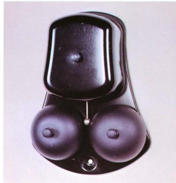
Indoor or outdoor 2½" gongs