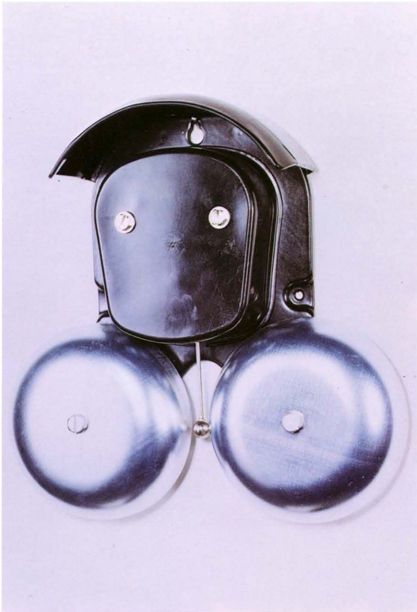
Indoor or outdoor 6" gongs