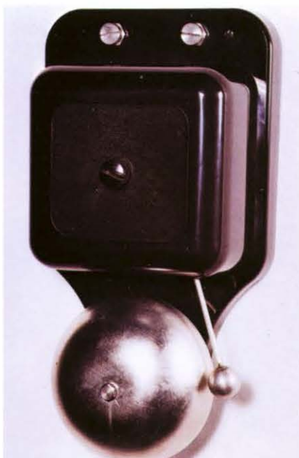
Indoor 4" gong