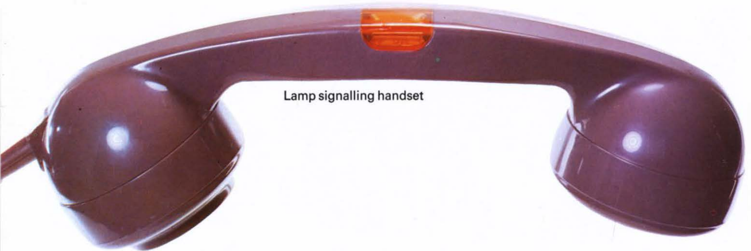
Lamp signalling handset

Mains operated lamp signals (see General Information) are provided when a more powerful lamp signal is required. These can be arranged to flash with the ringing or light continuously until switched off manually.