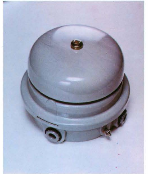
Indoor or outdoor Mains powered 6" gong