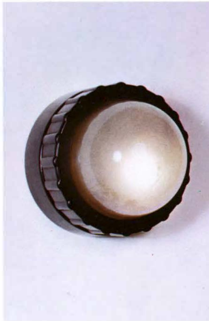
Low voltage lamp fitting

Lamp signals can be intermittent or can glow steadily. Dependent on type they may either cease when the call is answered or be switched off manually.