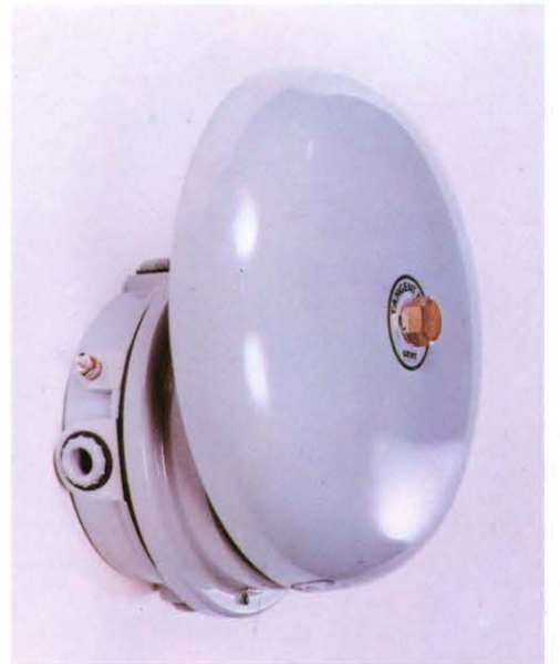
Indoor or outdoor Mains powered 10" gong