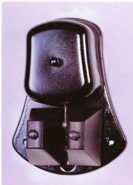
Indoor or out door 'Cow' gongs