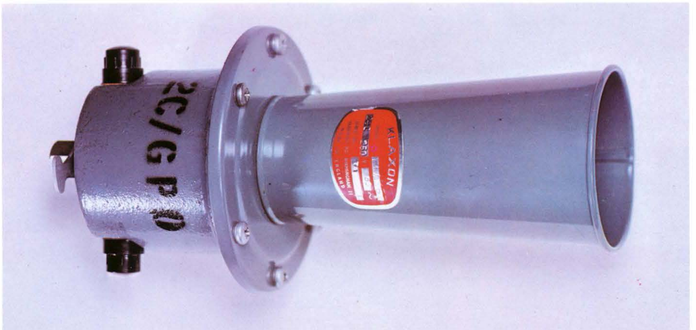
Indoor or outdoor Mains powered 'Hooter'