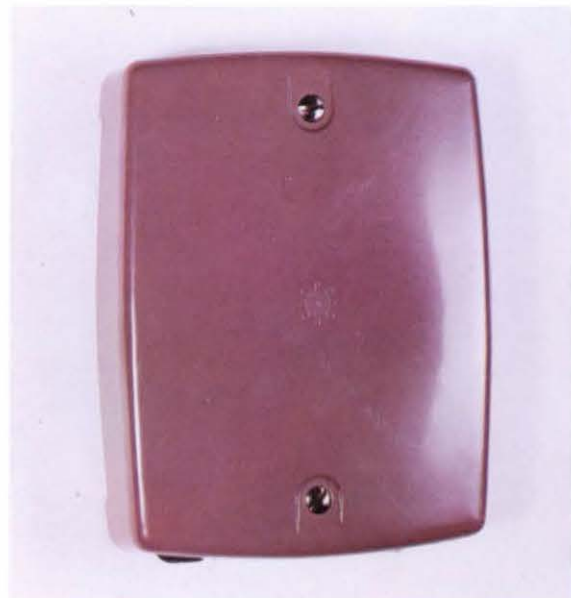
Indoor 2½" gongs (black, grey or ivory)