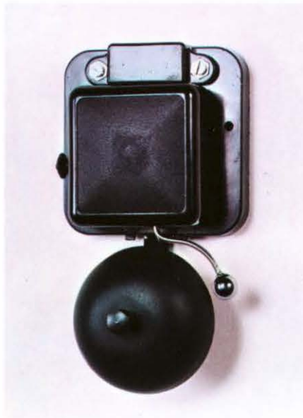
Indoor 2½" gong

A mains-powered hooter (see General Information) is an alternative to the bell with the 254mm (10") gong in very noisy conditions, but this is not permitted to sound continuously.