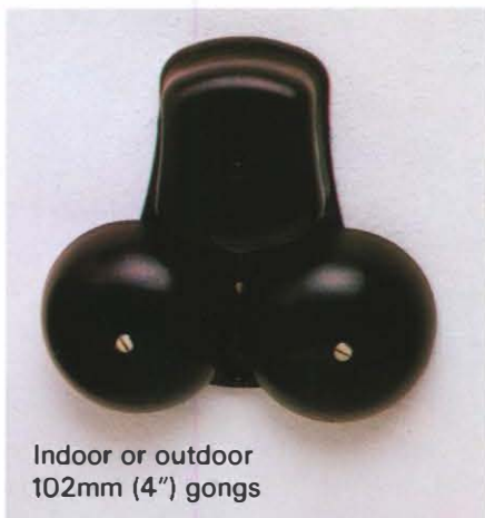
Indoor or outdoor 102mm (4") gongs