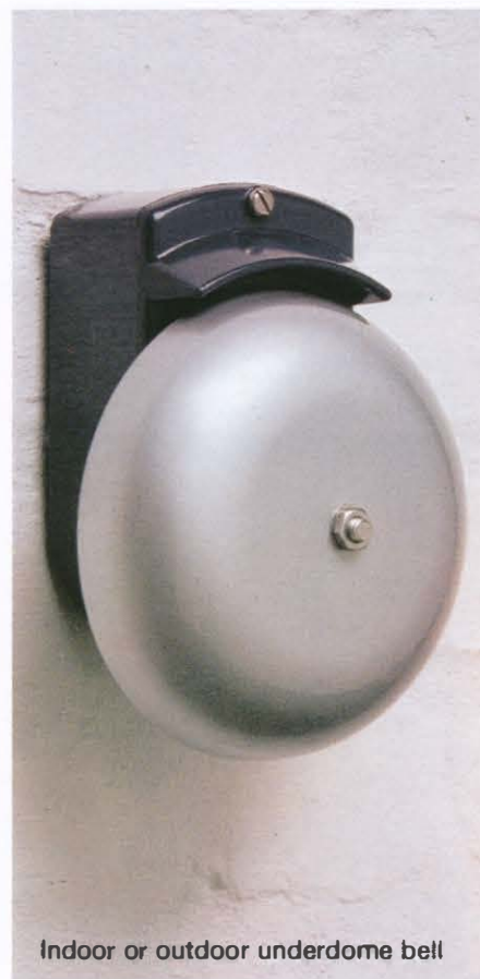
Indoor or outdoor underdome bell