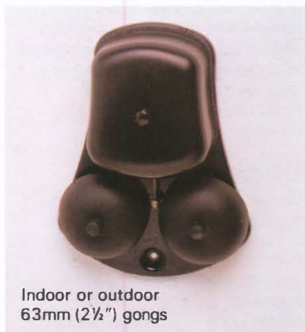
Indoor or outdoor 63mm (2½") gongs