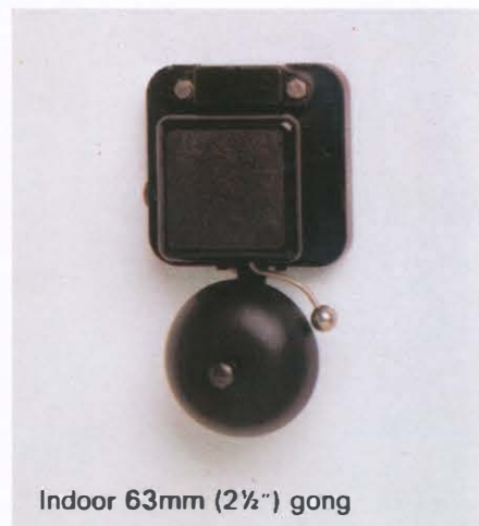
Indoor 63mm (2½") gong