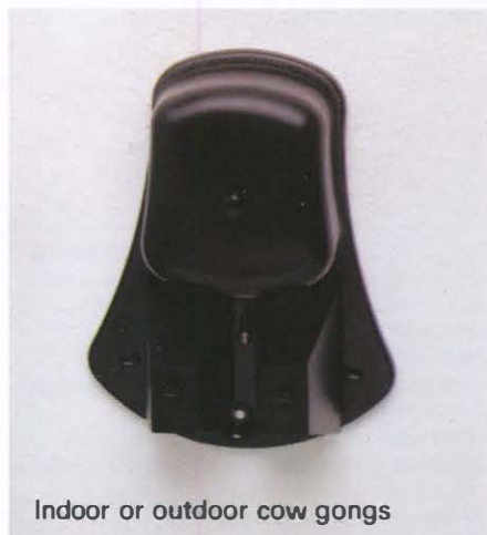
Indoor or outdoor cow gongs