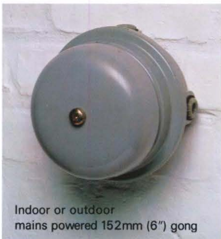
Indoor or outdoor mains powered 152mm (6") gong

A mains-powered hooter (see General Information) is an alternative in very noisy conditions, but this is not permitted to sound continuously. Care should be taken when siting hooters as these can become a nuisance to neighbours.