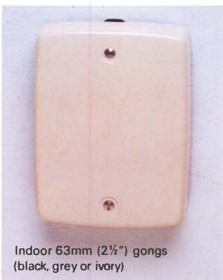
Indoor 63mm (2½") gongs (black, grey or ivory)