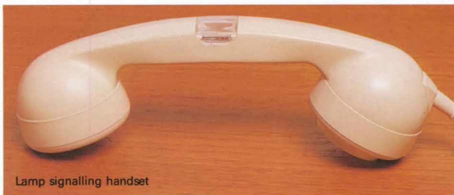
Lamp signalling handset

If you need a louder bell, or an extra bell, or wish to tell the difference between calls on two telephones, we can provide a selection of bells and lamps to supplement the normal telephone bell.