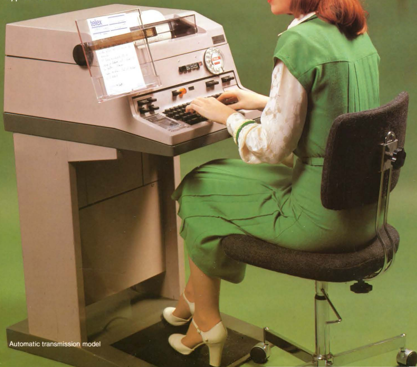
Automatic transmission model

The Teleprinter 15 has many special features, but it is simple to use as the keyboard layout is similar to that of an electric typewriter.