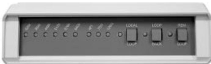
NTU16A front view

If you have ordered a single KiloStream N (320, 384, 448, 512, 576 or 640 kbit/s) circuit, the unit is contained in a grey rectangular box. The lamps on the front of the unit show the operating state of the circuit. The unit can be wall mounted, using appropriate fixing screws, or laid flat.