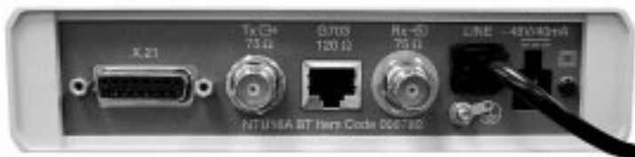
NTU16A rear view