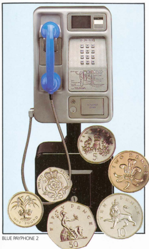
BLUE PAYPHONE 2