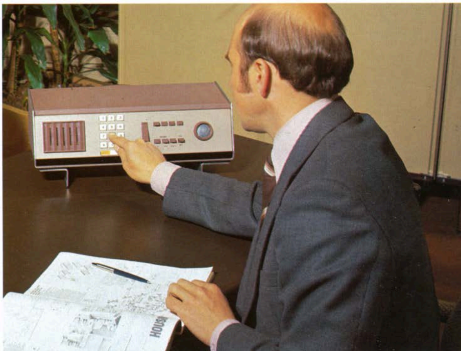
LST 4 MF Telephone