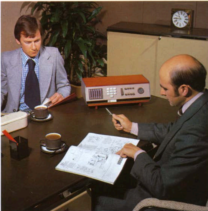
LST 4E Telephone

This unit allows changeover to the privacy of handset operation.