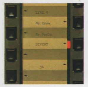
press a button and all your incoming calls will automatically be diverted to another terminal of your choice, leaving your terminal free to make any kind of outgoing call.