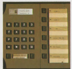
operation for line selection, internal and external calling, and facility access.