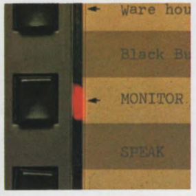
the progress of calls can be monitored using the loudspeaker – no need to lift the handset until the call is answered.