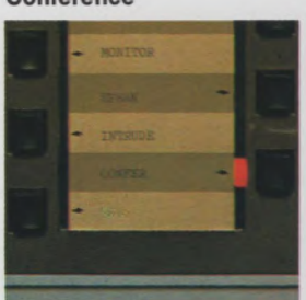
up to six terminals can confer.