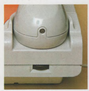
Distinctive signals for external and internal calls at each terminal with volume control.