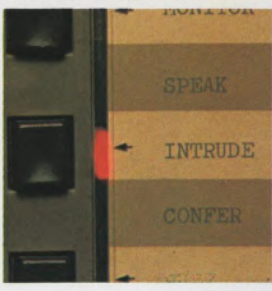
for urgent messages selected terminals may break into an established intercomm call with a warning tone.