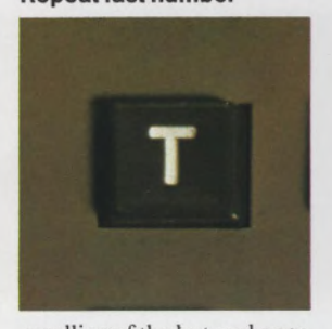
recalling of the last exchange call made using a single press-button.