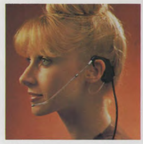
the handset can be replaced by a headset.