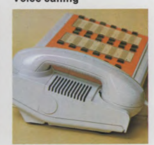
messages can be received over a small loudspeaker built into the terminal.