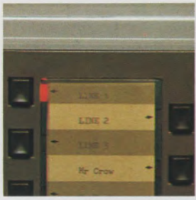
lamp signals to identify lines in use and the status of other terminals.