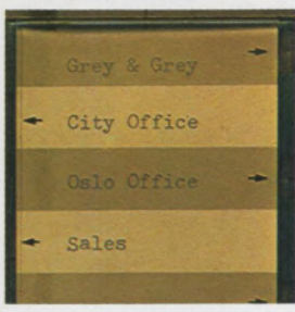
storage and calling of frequently called numbers using a single press-button.