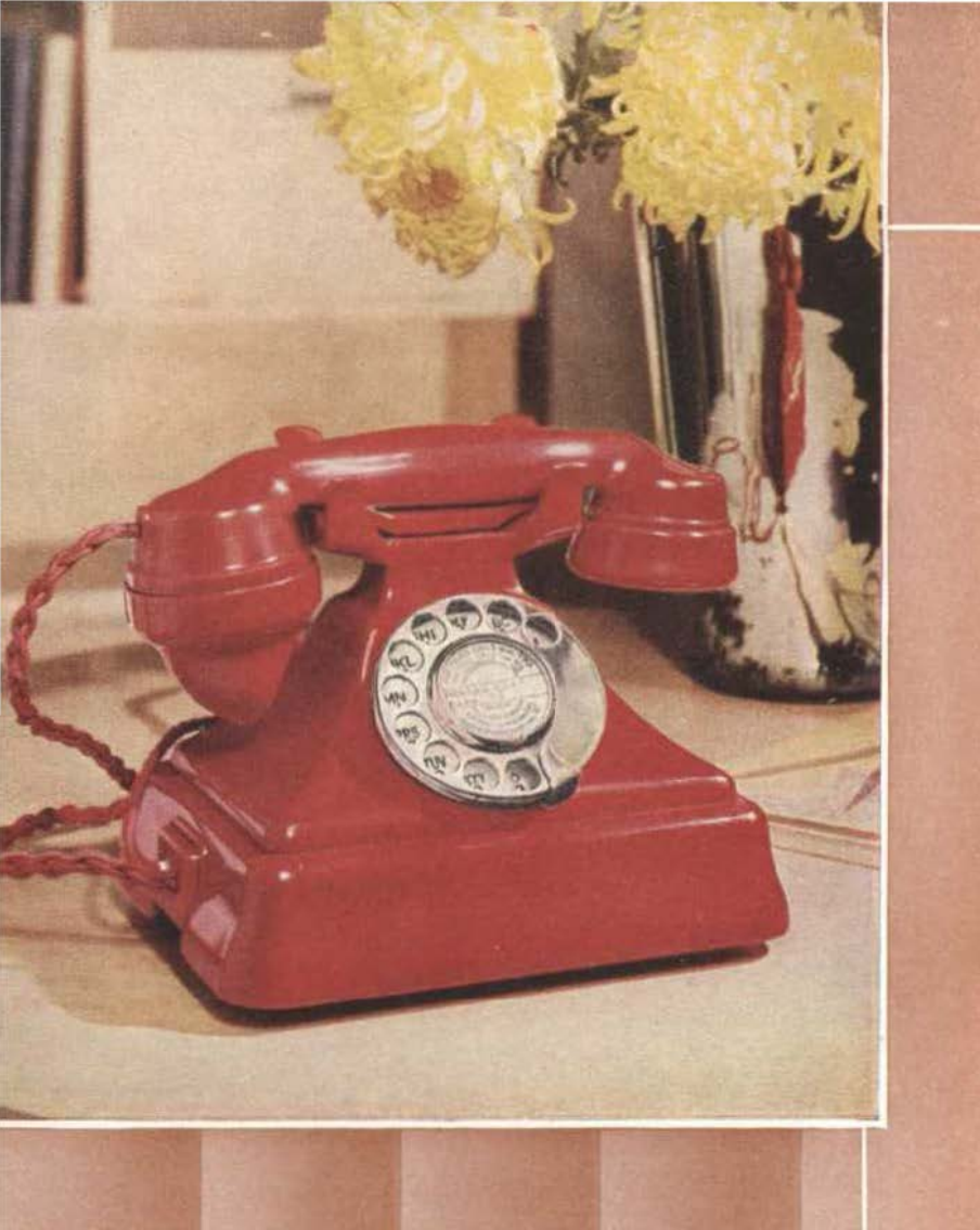
the drawing room