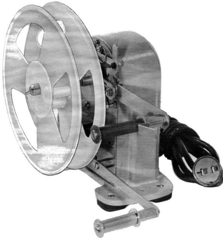
Figure 1 - Tape Winder

2.02 The Tape Winder consists of a cast aluminum housing, a flat steel plate attached to the housing, an adjustable tape reel, and a power cable. An electric motor with a gear arrangement and a power switch are mounted onto one side of the steel plate and are covered by the housing. A tape winding control switch and operating arm with roller, braking wedge and brake operating lever, and strip with roller are mounted onto the side of the steel